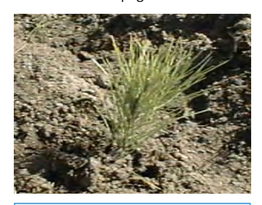
Lower Loup NRD conservation tree seedlings are $0.85 per seedling.

NRCS or your LLNRD technician. Trees may also be ordered on the LLNRD web site at www.llnrd.org just click on "Buy Trees" on the right side of the main page.